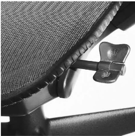
Full Range of Adjustments