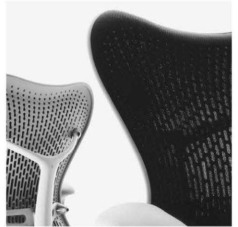
Latitude™ Back Upholstery