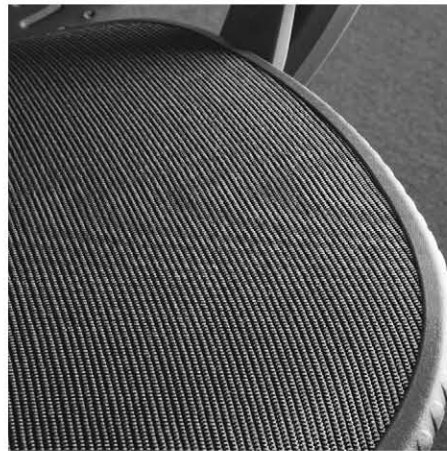
AireWeave™ Suspension Seating