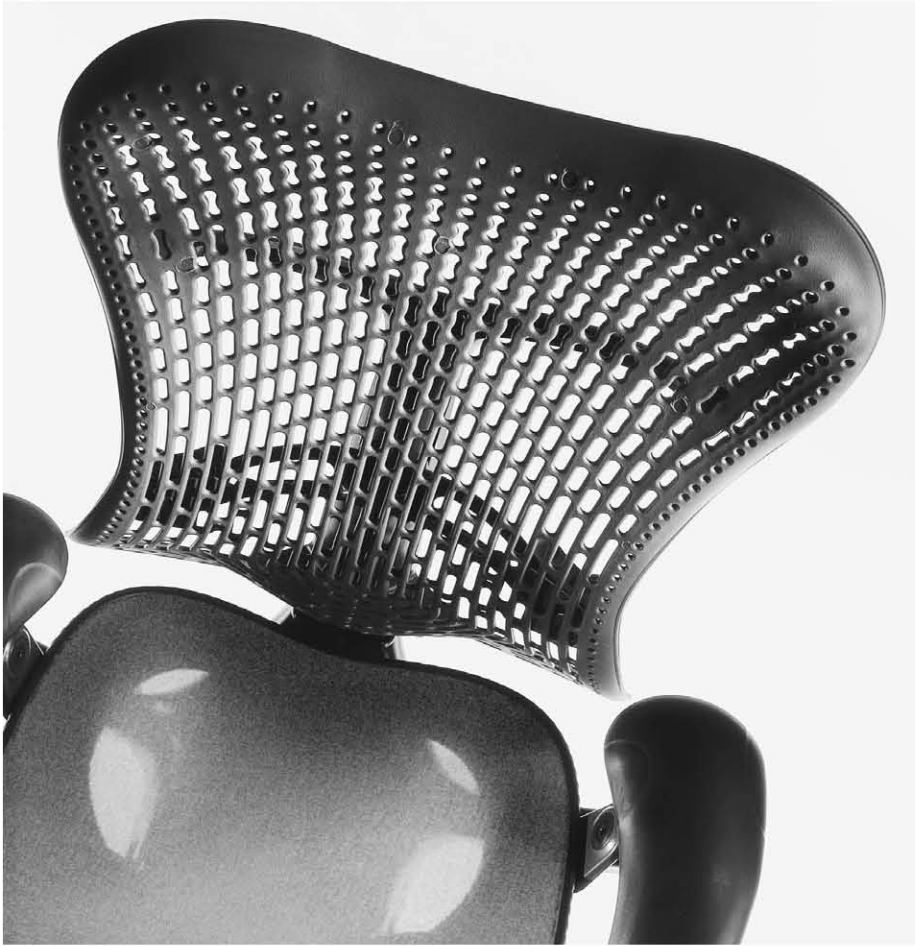
TriFlex™ Polymer Back